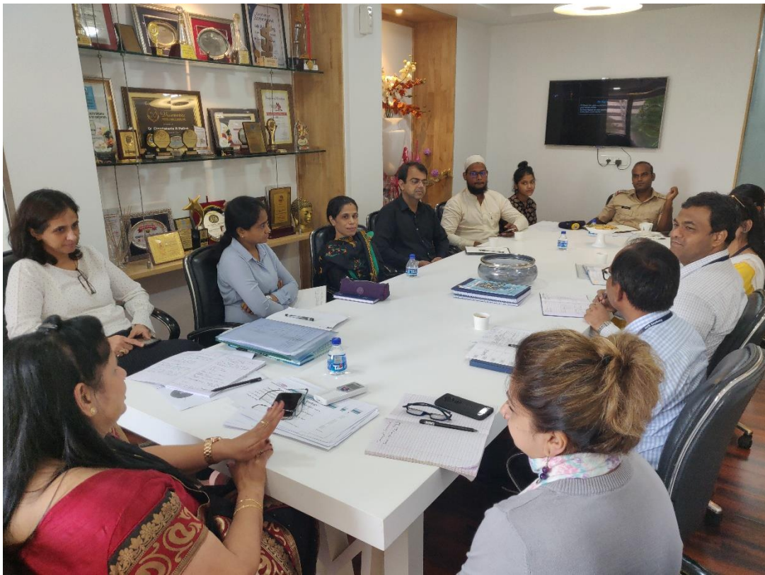
Mr. PHOTTE FROM TRAFFIC POLICE AT TRANSPORT COMMITTEE MEETING ALONG WITH THE BUS CONTRACTORS AND TRANSPORT COMMITTEE MEMBERS